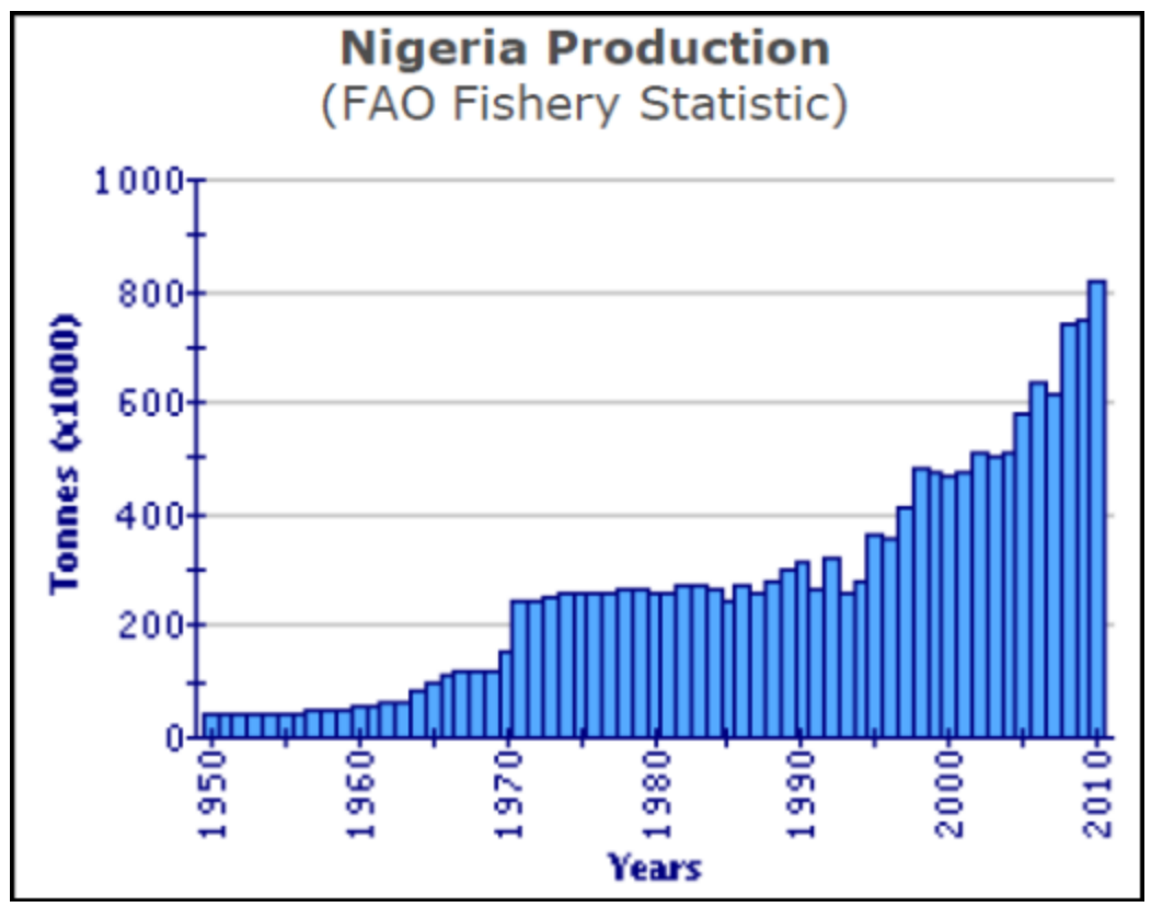
Table. 1. Total fish production in 1950 to 2010.