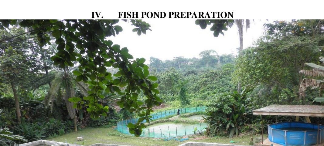
Fig 1-A farm consisting of earthen, concrete and collapsible ponds

\cdot It has genetic potential to grow to a very large size (up to 10kg).